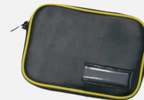
Fig. Drop-in bag